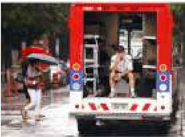
Task force: Time for massive changes at Canada Post