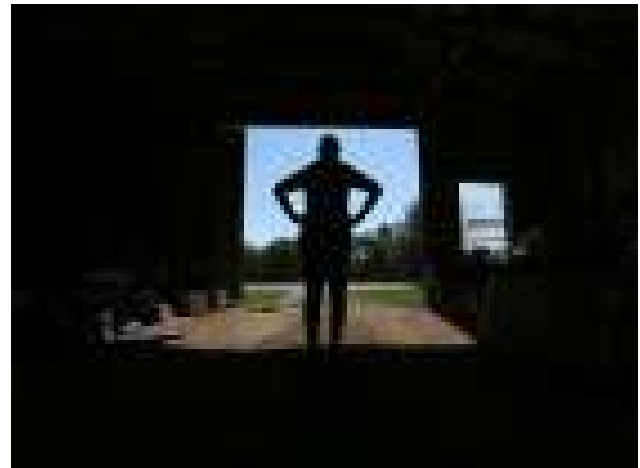
How Ontario is failing its rural residents — and why it