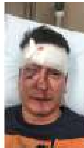
'The hate still exists': Saskatoon man says he was beaten for being gay