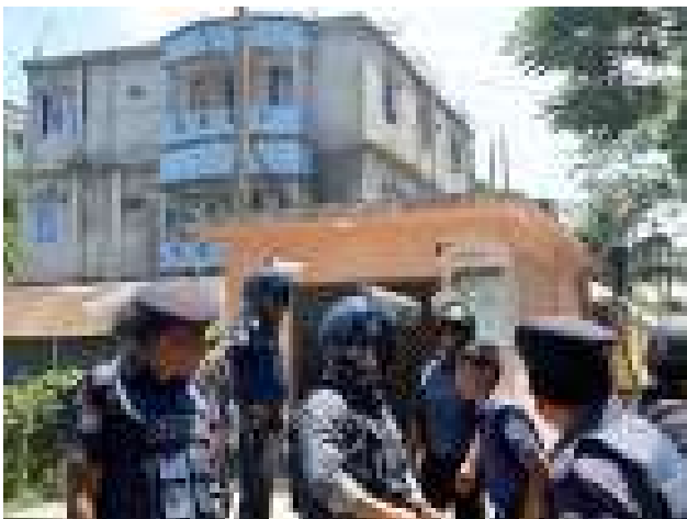
Body of alleged terrorist leader hasn't been claimed