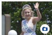
PHOTO GALLERY Rose Festival parade

PHOTO GALLERY Trudeau says ISIL mission, Keystone came up in chat with Obama