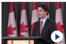
PHOTO GALLERY Trudeau says ISIL mission, Keystone came up in chat with Obama

PHOTO GALLERY New place space at Lincoln Centennial