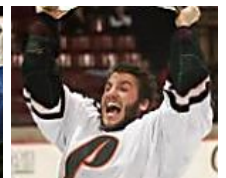
Two people dead in helicopter crash in northern New Brunswick