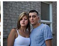
VIDEO: GM workers in Oshawa, Ont., brace for 'the fight of our lives' in auto talks