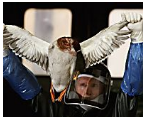
30 Photos That Prove the World Is Ending Warped Speed