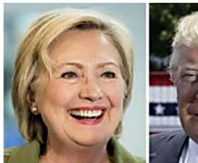
LEGER: Hard to see a good result for Canada in the U.S. election