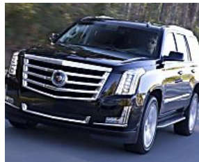
Herald Wheels Online!