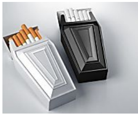
10 Creative Packaging Designs Cheqthis