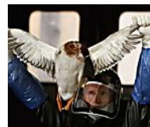
30 Photos That Prove the World Is Ending Warped Speed