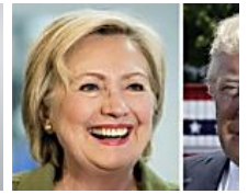
LEGER: Hard to see a good result for Canada in the U.S. election