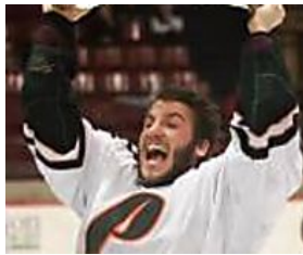
Two people dead in helicopter crash in northern New Brunswick