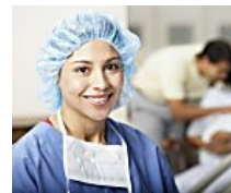
10 Highest Paying Degrees in the World TopManFun