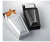
10 Creative Packaging Designs Cheqthis