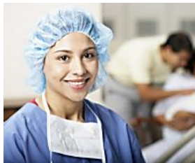
10 Highest Paying Degrees in the World TopManFun